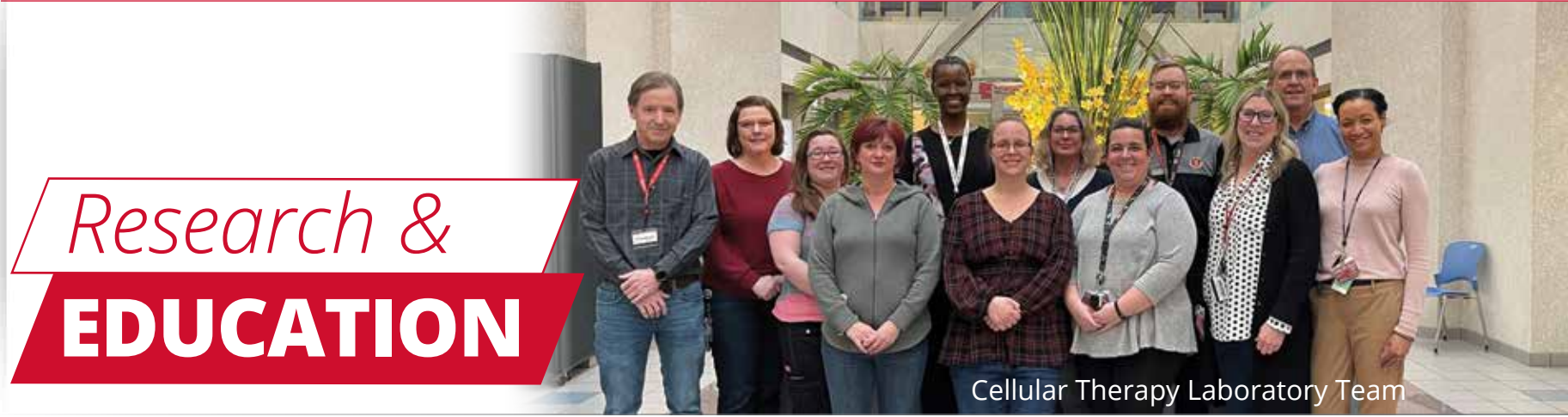
Cellular Therapy Laboratory Team